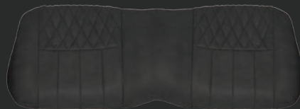
■ SC CONTOUR - DIAMOND TOP $2,095