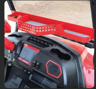
■ LOWER DASH TRAY $495