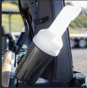
■ SAND & SEED BOTTLES $155