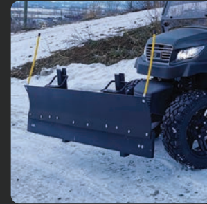
WNTR PLOW $1,995