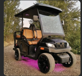
UNDER CART LED $595