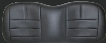
■ SC CONTOUR - CROSS PANEL $2,095