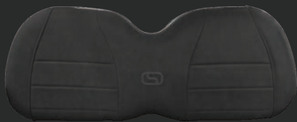
■ SC SPORT (INCLUDED STANDARD)