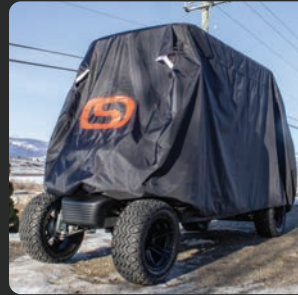
STORAGE COVER $395