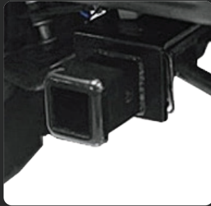
FRONT HITCH RECEIVER $435