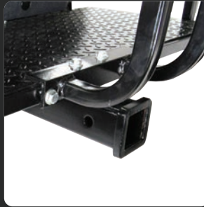
REAR HITCH RECEIVER $495