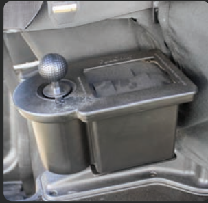
■ BALL & CLUB WASHER $225