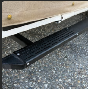
RUNNING BOARDS $995