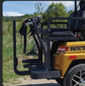
REAR BAG HOLDERS $595