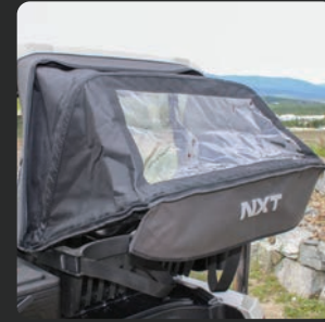
■ BLACK CLUB COVER $725