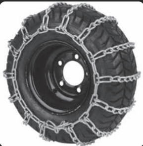
TIRE CHAINS $295