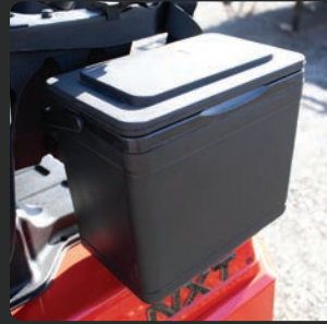
■ COOLER $245