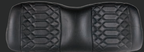
■ SC CONTOUR - CROSS DIAMOND $2,095