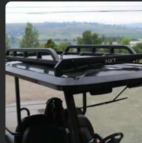
ROOF BASKET $1,295