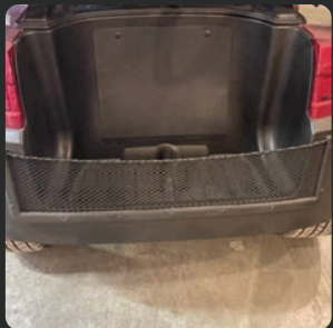
BACK MESH RETAINER $225