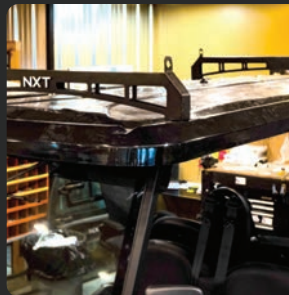
ROOF RACK $795