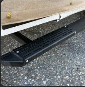
RUNNING BOARDS $1,795