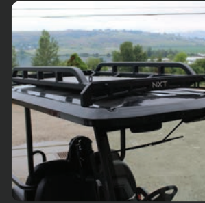
ROOF BASKET $1,295 (REQUIRES ROOF RACK)