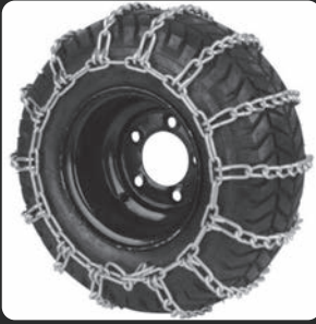
TIRE CHAINS $295 (SET OF 2) (REQUIRES LIFT KIT)