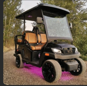
UNDER CART LED $795