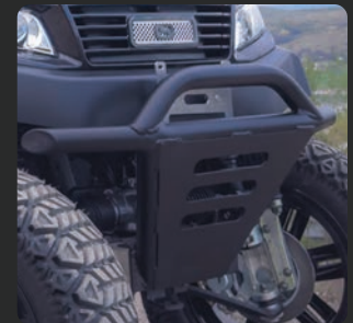
BULL BAR $695 (REPLACES LOWER VALANCE. INCLUDED WITH LIFT KIT)