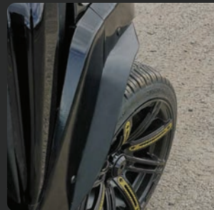
SPLASH GUARD FENDERS $375