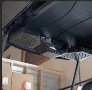
OVERHEAD STORAGE $575 (NOT AVAILABLE WITH LSV PACKAGE)