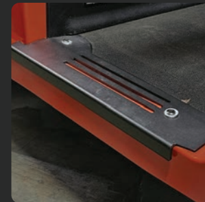
SIDE SILLS $695